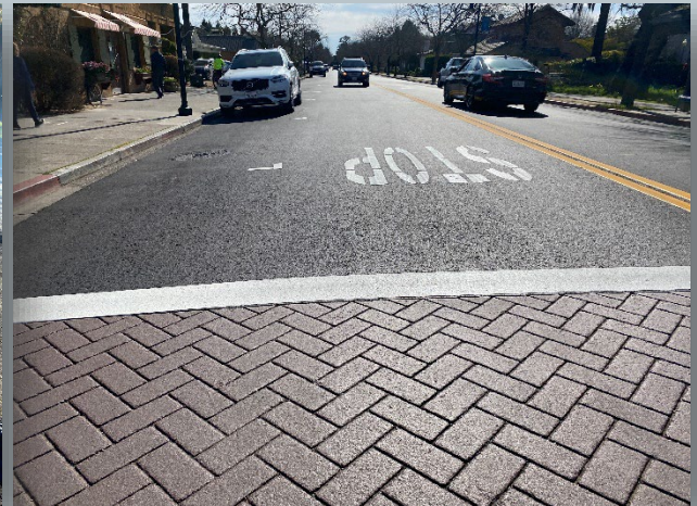
Mulberry Street Southbound Before, During and After Construction