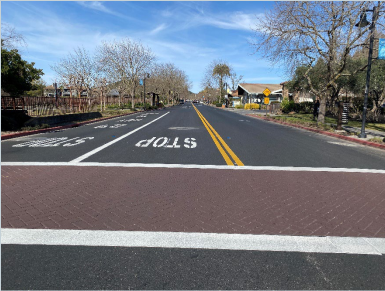
California Dr. Northbound