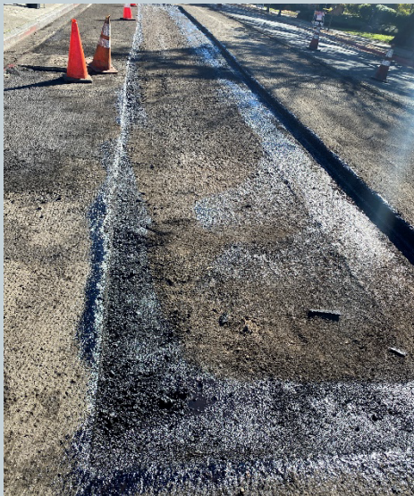
Digout/Deep Pavement Repair