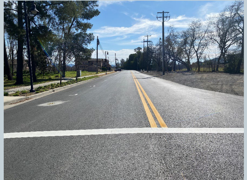
Champagne Dr. Southbound