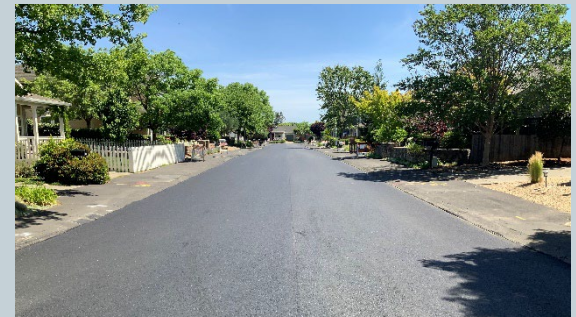
Washington Park Neighborhood