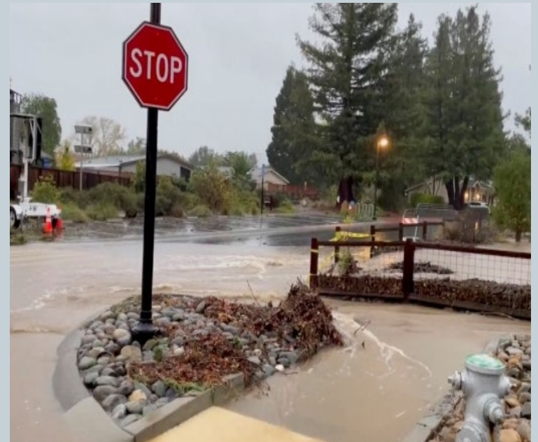
Yountville Flooding October 2021 Storm