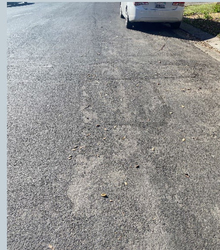
Humboldt Street Digout/Microsurfacing