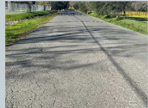
Yount Mill Rd.