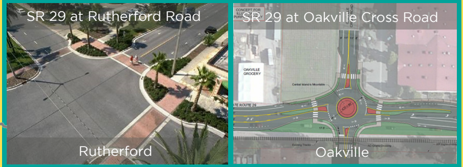
Renderings of Project Options