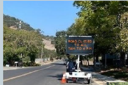
Yount Mill Road