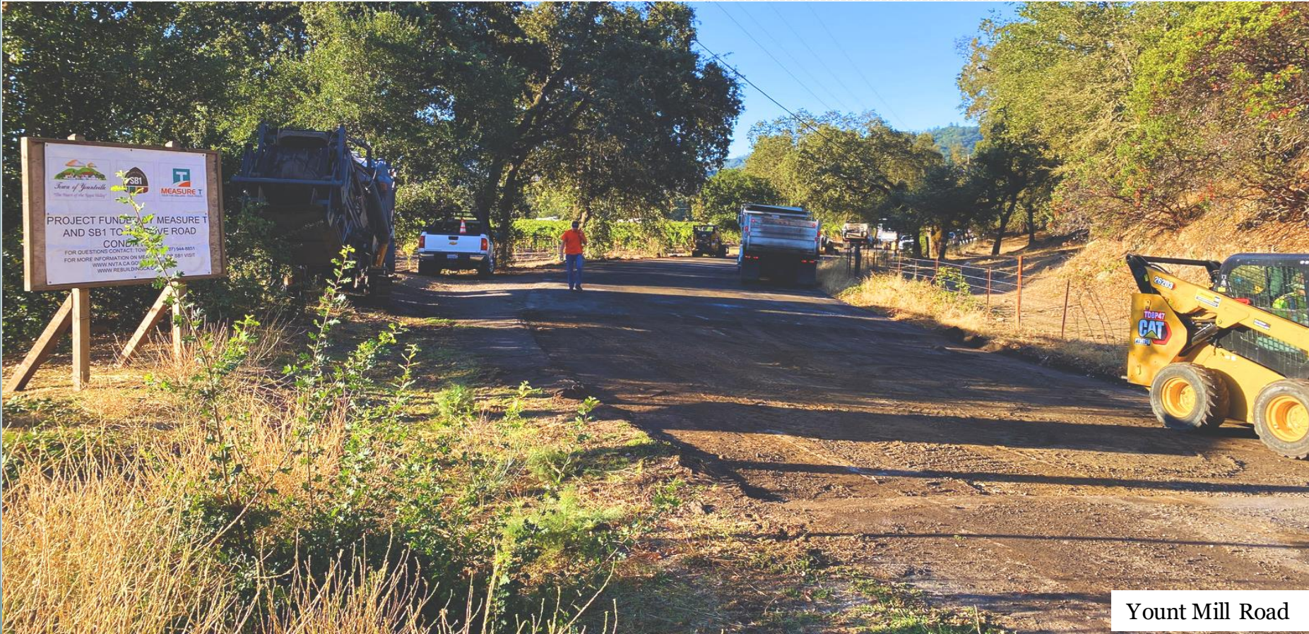
Yount Mill Road