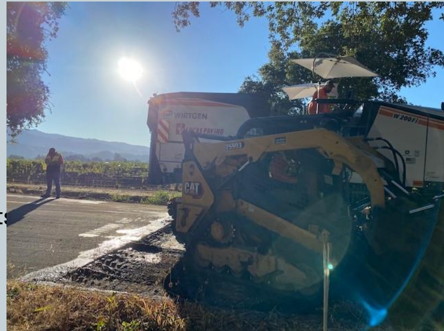
Yount Mill Road