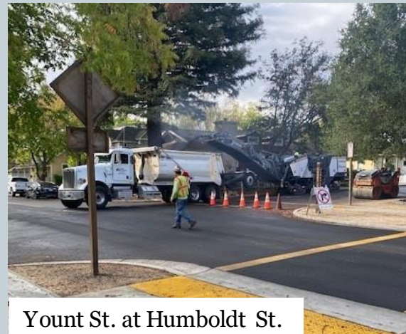
Yount St. at Humboldt St.