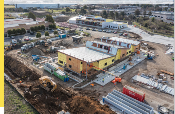
Current Construction, February 2023

NVRTA is building a new maintenance and administration facility to address the growing needs of the transit operations. The current facility is ill-equipped to handle the existing needs and future growth. The project will allow NVTA to maintain and expand transit service for the next 50 years.