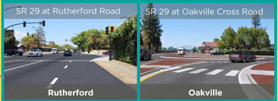
Renderings of Project Options