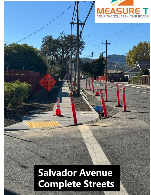
Salvador Avenue Complete Streets