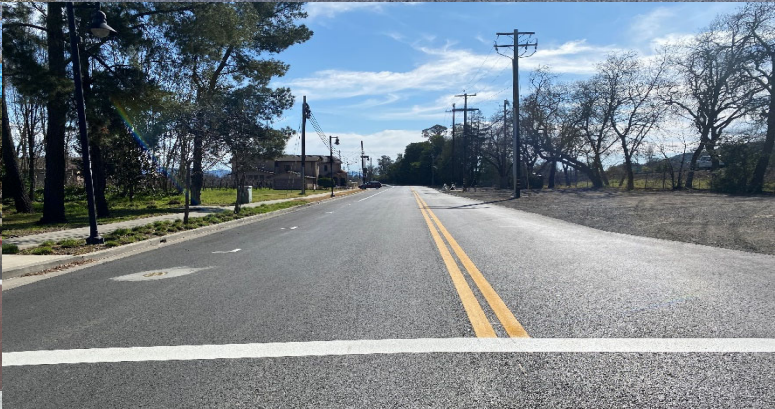
Washington Street South Rehab