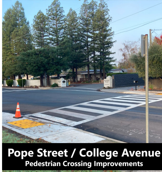
Pope Street / College Avenue Pedestrian Crossing Improvements