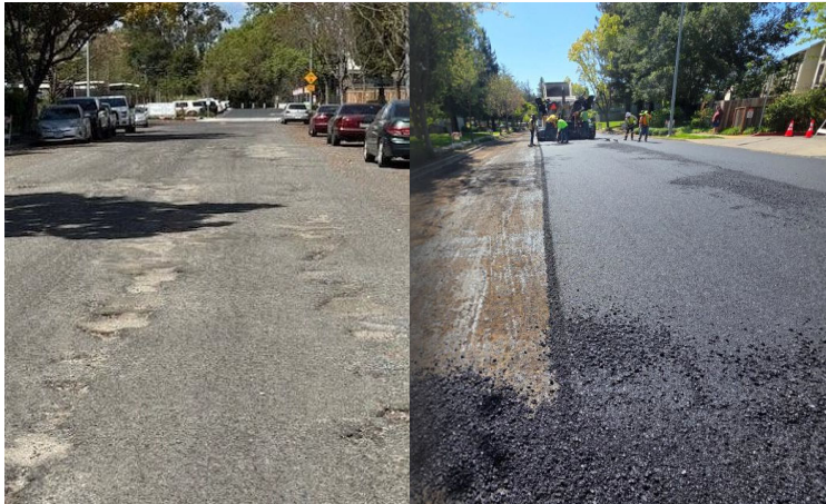
Valle Verde Drive