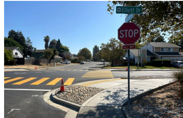
Pedestrian Crossing / Safety Improvements