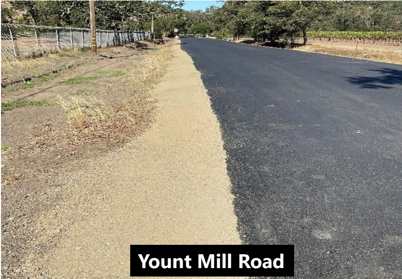
Yount Mill Road