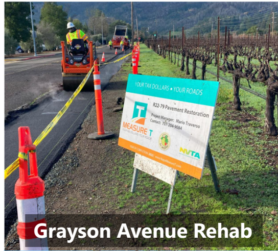
Grayson Avenue Rehab