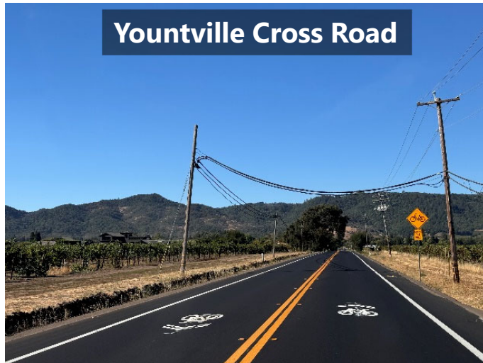
Yountville Cross Road